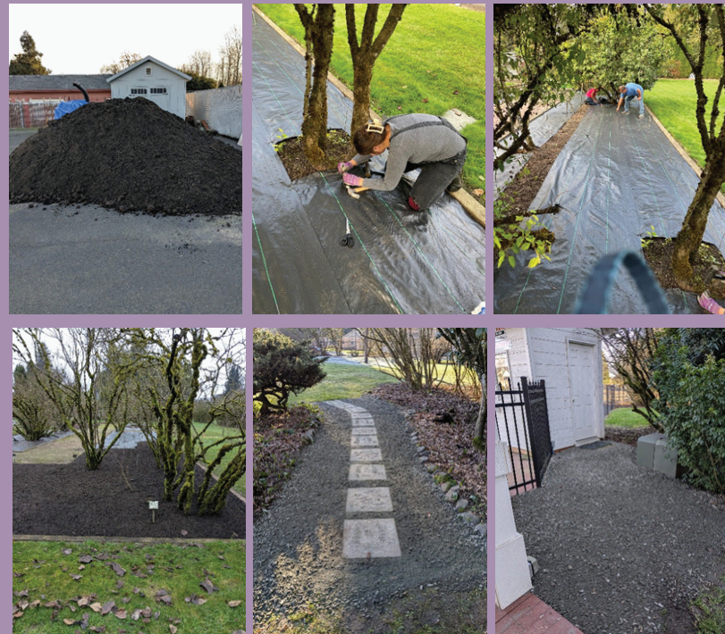
Shown here is the compost pile that is disbursed in the beds, the install of the weed cloth, the partially completed beds, and also some of the new gravel in some of the areas.

GARDEN & MAINTENANCE - There has been a very large project in the gardens that began in summer 2024. The old irrigation system had many, many leaks and was very aged. There's been a major overhaul of replacing pipes and sprinklers in the formal gardens and also in some other areas. A special thanks goes out to Dwight Dahl, our Maintenance man, who did most all of the irrigation work. This was followed by new weed cloth and now new compost in the formal gardens, new gravel on pathways and more. It's been a project that's taken months to complete. We were fortunate to receive a grant from the Garden Conservancy and some other generous donations that helped with some of the expenses. Kudo's to ALL our garden staff for doing this very labor intensive project. It is continuing but we will have it finished for Lilac Days 2025.